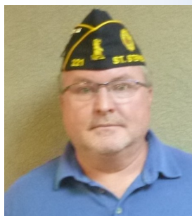
Commander Leo Supan Air Force